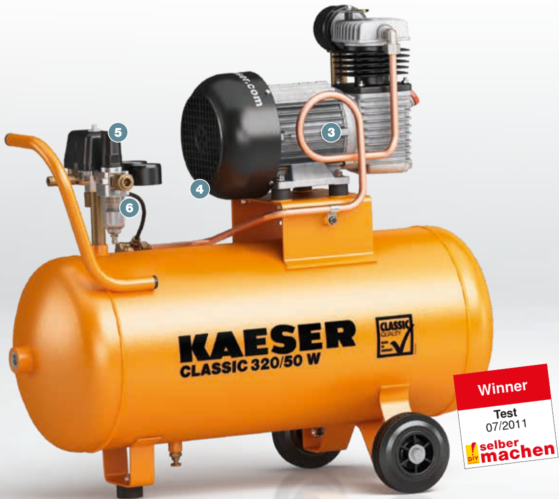
Image: CLASSIC 320/50 W