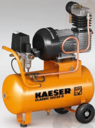
Image: CLASSIC 320/25 D