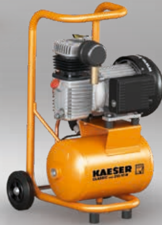
Image: CLASSIC mini 210/10 W