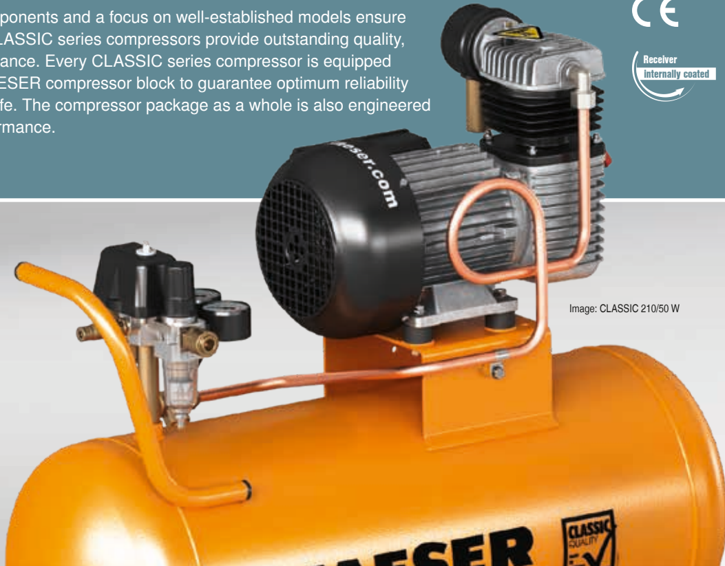
Image: CLASSIC 210/50 W