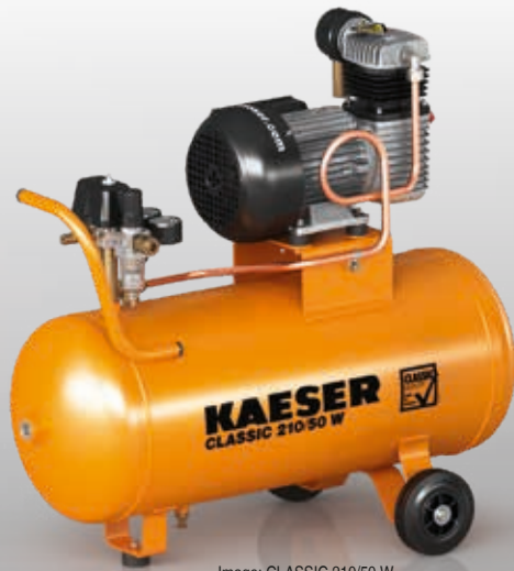
Image: CLASSIC 210/50 W