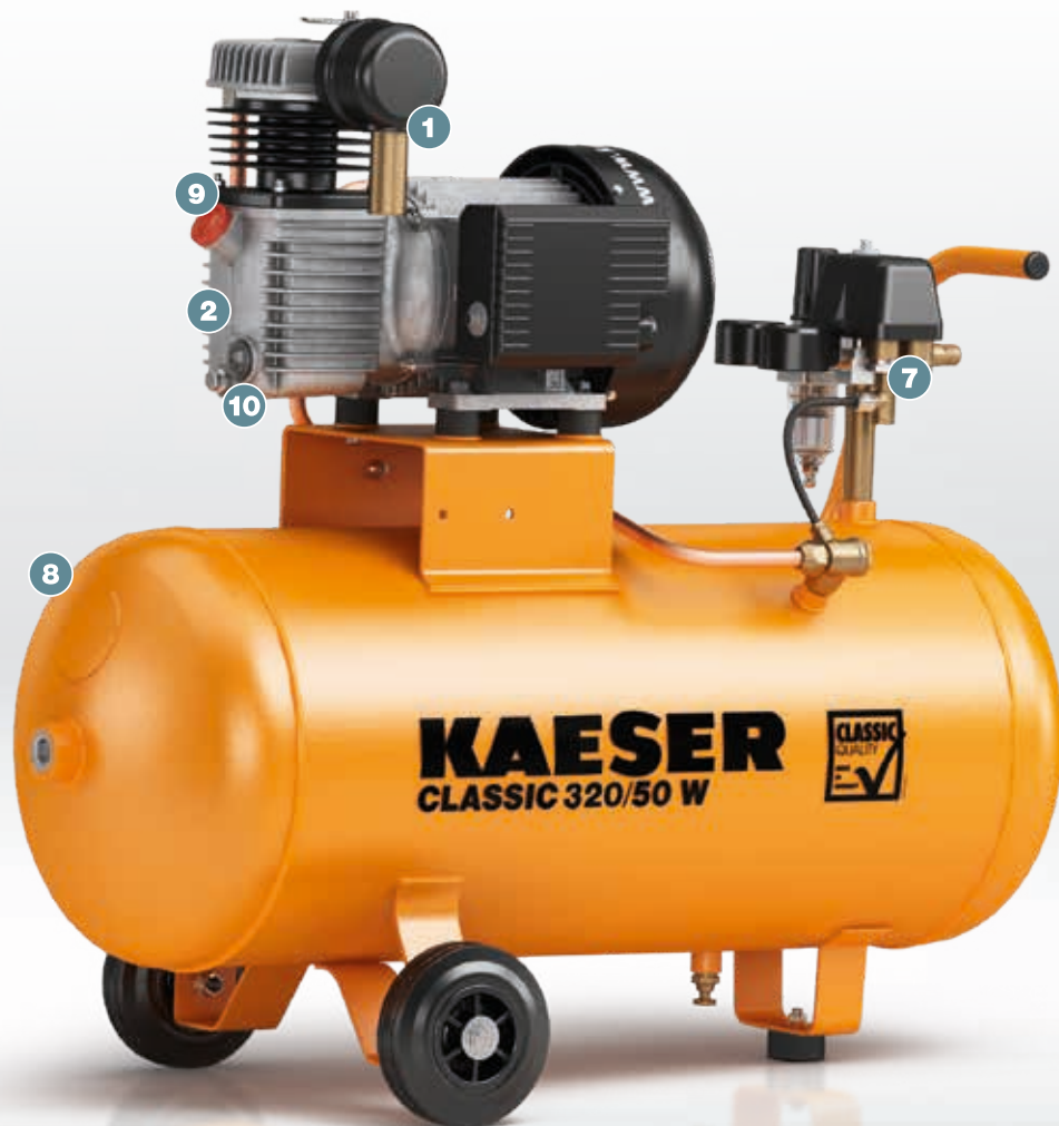
Image: CLASSIC 320/50 W