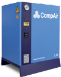
Compressor base mounted