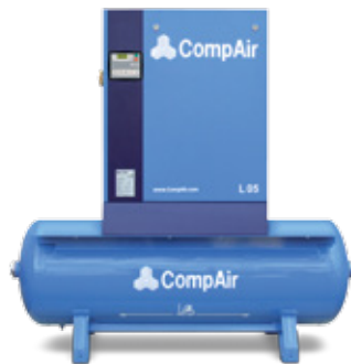
Receiver mounted compressor