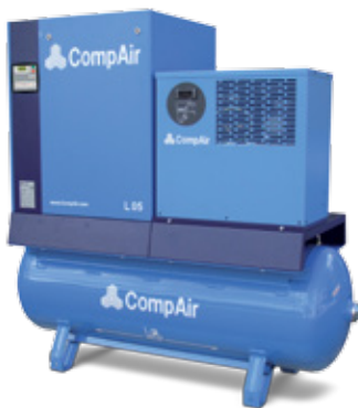
Complete airstation including compressor, dryer and receiver